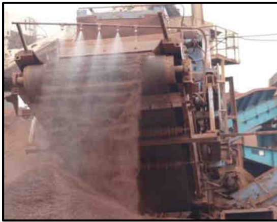
(Arrangement of dry fog system at crusher)