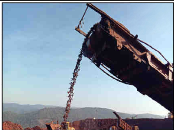
(Arrangement of dry fog system at Crusher)