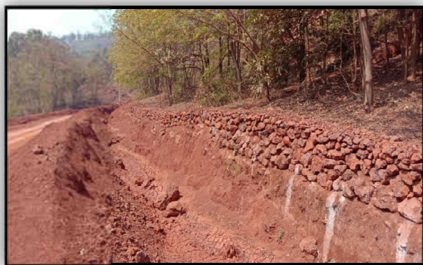
(Plantation along the toe of the Dump)