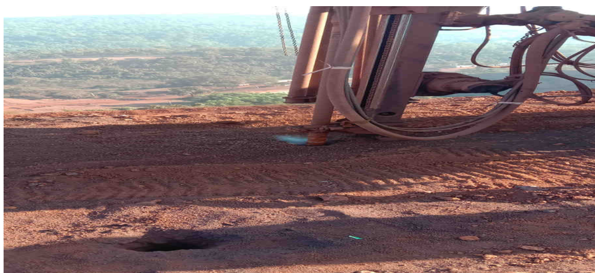
(Drill machine provided with dust extractor with water injection system)