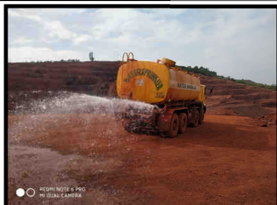
(Water Sprinkling on Haul Road)