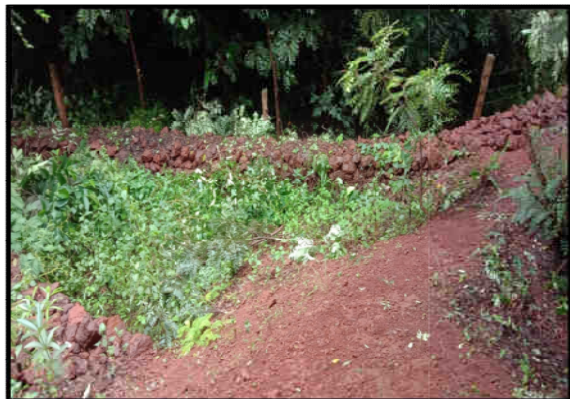
(View of Retaining wall around SG Dump)