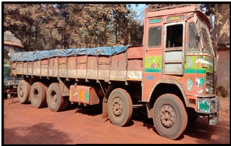
(Mineral transportation in covered vehicle)