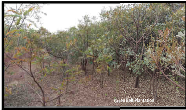
(Safety zone plantation)