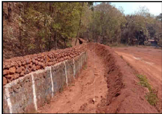
(View of Retaining wall around OB Dump)