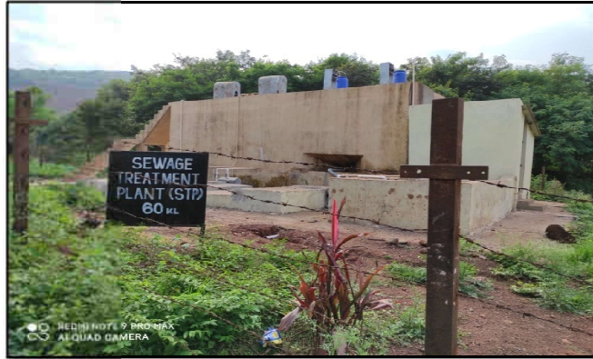
(VIEW OF STP)