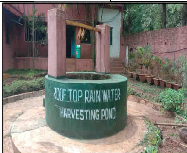
ROOF TOP RAINWATER HARVESTING STRUCTURE