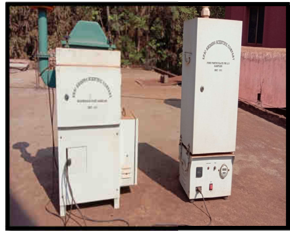
(Installation of RDS for monitoring of Air)