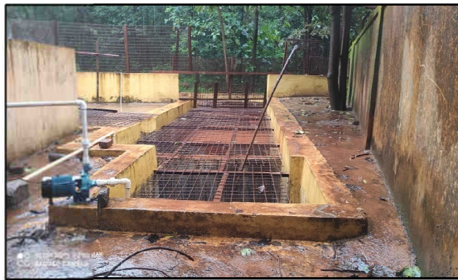
(VIEW OF ETP)